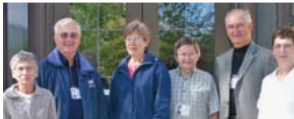
CMBC graduates of 1965 meet at 2005 CMU Homecoming.

Homecoming is especially designed for people who graduated in years ending in the same num-