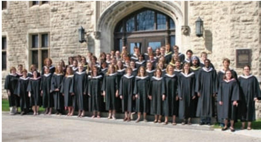
2006 CMU graduates: A life lived in Christ participates “in the reconciling work of God.”