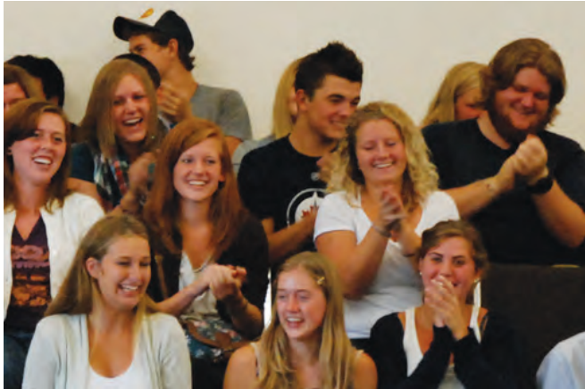
Outtatown students enjoy Class of 2012 celebrations.

On April 14 and 15, 92 graduates from the 2011-2012 Outtatown program gathered on the Canadian Mennonite University (CMU) campus to celebrate their experiences in Africa and Guatemala. They shared their experiences through stories and music during their two-day graduation program attended by family and friends, site leaders, and Outtatown