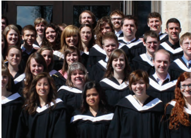
Graduates gather for a final time on the steps of Founders Hall.