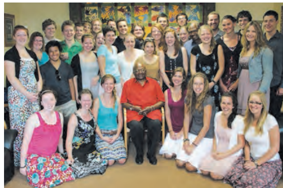
Archbishop Desmond Tutu, centre, with Outtatown students 2012

Letkeman described the man who helped lead South Africa's Truth and