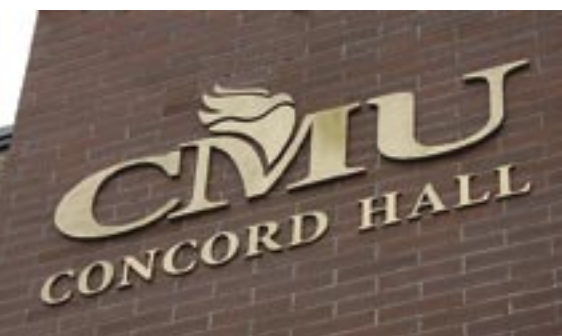
Concord Hall, CMU's new student residence – the most energy-efficient building in Manitoba.